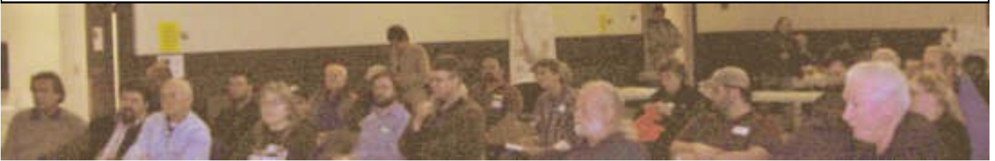
Members of the 11th Legislative District Democratic Party contemplate 2007 reorganization.